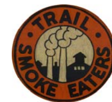
Vintage Smoke Eater crest.

A site featuring vintage Smoke Eater memorabilia, we feel, will act as a much more effective marketing tool than the Society's site alone. The user will browse the